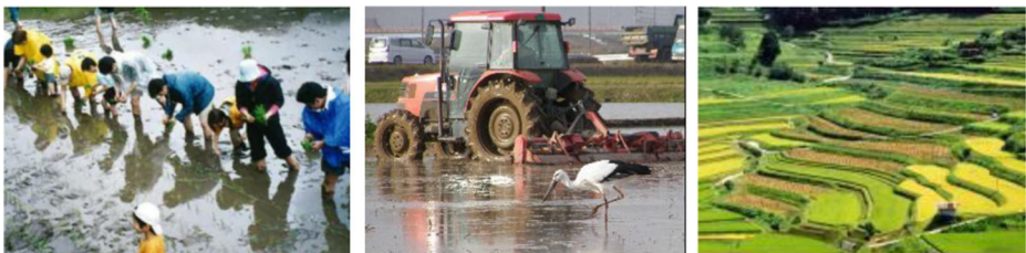
Fig. 2 Stimulus for multifunctionality

The group to be given information regarding the efforts to protect the environment was shown three photographs related to fish cradle rice (taken from the website of Shiga Prefectural Government). This group was first shown the following passage from the prefecture website: "In Shiga Prefecture, a fishway was created so that fish can go up to the paddy field. This way, we can observe fish laying eggs and breeding in the paddy field. We certify rice produced in fish-friendly paddies, such as those that use chemicals that have less impact on fish, such as fish cradle rice. Rice cultivated in a paddy that meets the fish cradle rice criteria established by Shiga Prefecture can use the following logo. Buying and eating fish cradle rice may lead to the protection of fish and Lake Biwa." Then, the group was shown the logo and three photographs in Fig. 3.